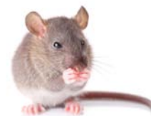
Big Stock Photo