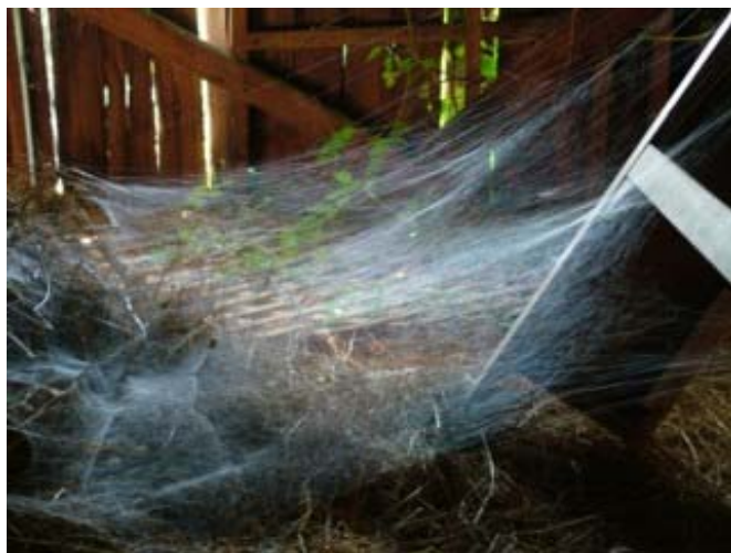
Fig. 5. Spider.

Spiders receive little respect for their efforts in the landscape. Below are three pictures sent to us by Van Burnette of Black Mountain, North Carolina (Figs. 5-7). Fig. 5 would be a pleasant surprise to anyone in the potting shed. This is probably the work of Agelenopsis sp., one of the grass spiders. Fig. 6 is probably Dolomedes tenebrosus , a fishing spider. These can be quite large and are often seen on a vertical surface with head pointed down. Fig. 7 is probably the orb spider, Neoscona crucifera [syn. hentzii ], that produces the classic spider web and is common in the garden or around barns. Fig. 8 is Argiope aurantia , from Mariellen Klick. For information on spiders in the landscape, see Ornamental and Turf Insect Note No. 137 at http://www.ces.ncsu.edu/depts/ent/notes/Other/note137/note137.html .