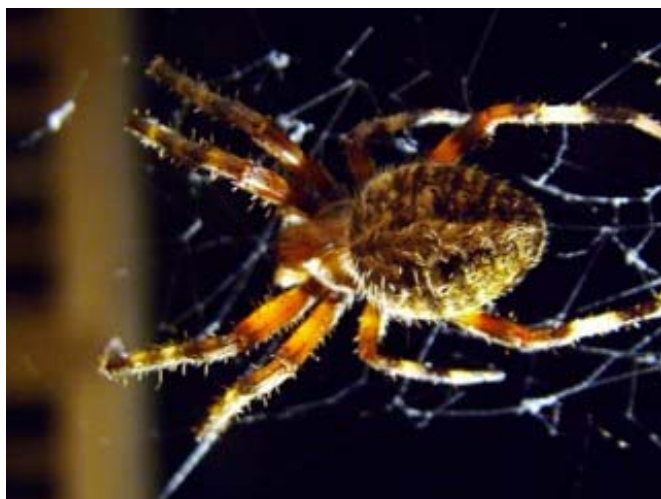
Fig. 7. Spider. Image by Van Burnette.