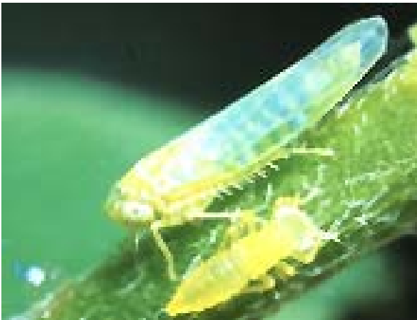
Fig. 3. Potato leafhopper adult and nymph.