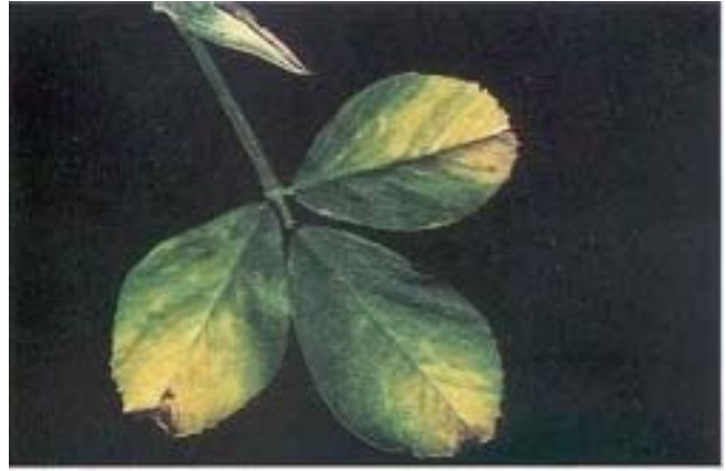
Fig. 2. Close-up of “hopper burn.” Image from Scouting Alfalfa in North Carolina , Publication AG-516, North Carolina Cooperative Extension Service.