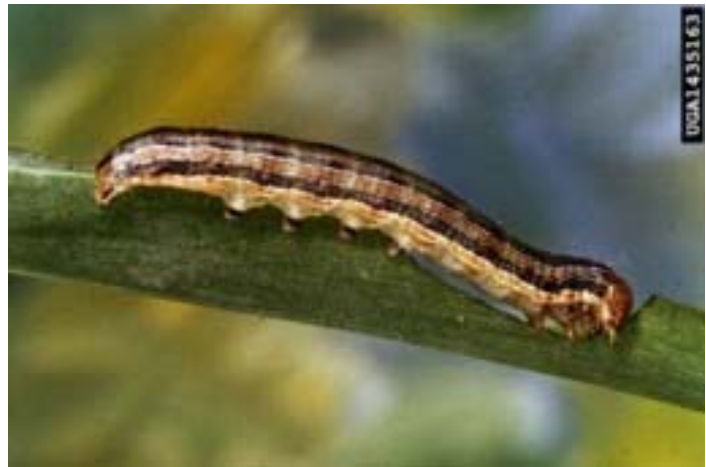
Fig. 4. Fall armyworm. Image by C. Gorsuch ( http://www.bugwood.org ).