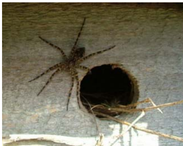
Fig. 6. Spider. Image by Van Burnette.