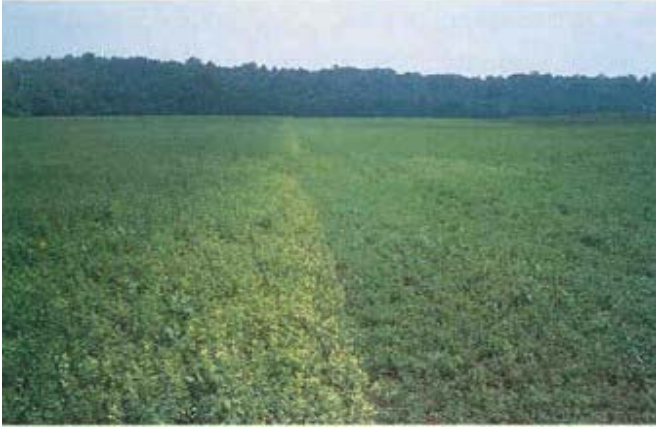
Fig. 1. Untreated versus treated alfalfa.