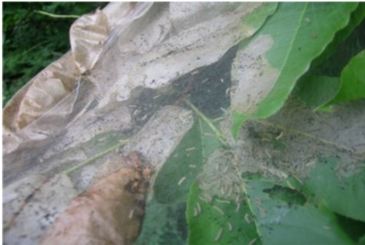
Fig. 4. Young fall webworm caterpillars on sourwood.

We usually think of the fall webworm as a tree foliage pest of late summer/early fall. That is generally true. However, what was once thought to be a first generation may really be a different race of fall webworm that comes out earlier. There seems to be enough evidence from Kansas State University entomologists to support this hypothesis. True or not, and earlier than I remember, this week I've noticed the beginnings of fall webworm webbing on sourwood (Fig. 4). Though it webs other trees, sourwood, pecan and persimmon are among its favorite hosts.