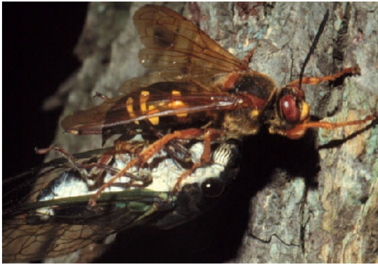
Fig. 3. Cicada killer wasp with cicada.