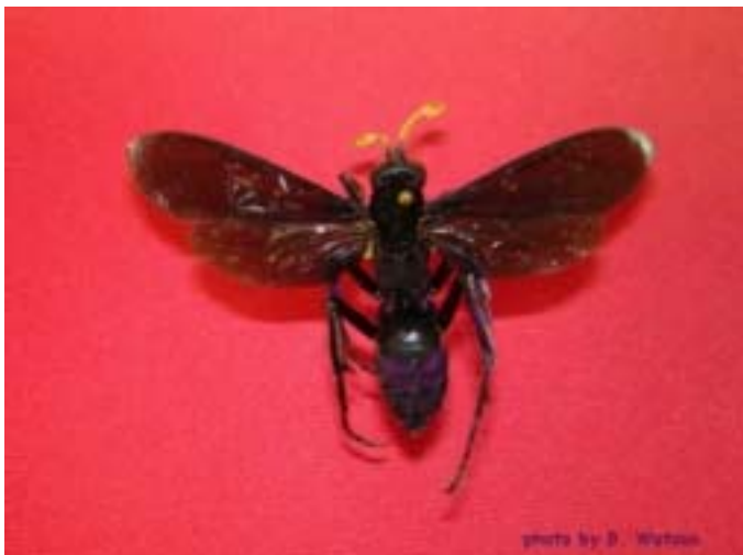
Fig. 5. Probable Pepsis sp. spider wasp.

Pompilid wasps, also called spider wasps (Fig. 5), are completely or mostly black and metallic in color and are often territorial. They prey on spiders to feed their young. The wasp stings the spider to paralyze it. It then drags the spider to its nest in the ground. Next, the wasp lays an egg on the spider. The egg hatches into a larva and the larva consumes the spider. Phil Rau reported several instances of unusual behavior of a pompilid wasp that uses water to ferry a too-large paralyzed spider to its burrow [Phil Rau, "Pompilid Wasps and Prey-Transportation by Water," Psyche , Vol. 41, No. 4, pp. 241-242, 1934].