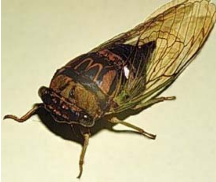
Fig. 6 Annual cicada.