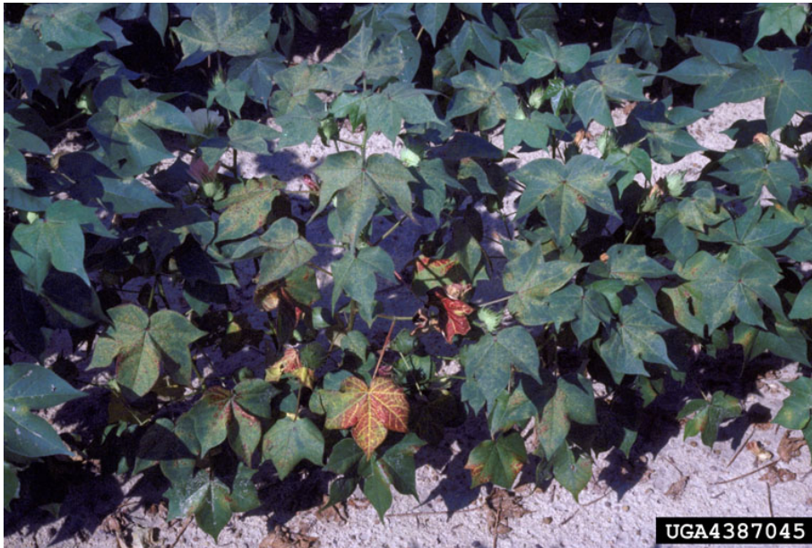
Fig. 1. Heavy mite infestation in cotton.

Dicofol (formerly sold by Dow under the trade name Kelthane) has been our “go to” product for the past few decades; however, Oberon and Zeal have also showed good activity in some tests. Although bifenthrin (Capture, Brigade, Discipline, and probably other products) has shown good mite activity in some tests, some mite populations have now become resistant to this chemical.