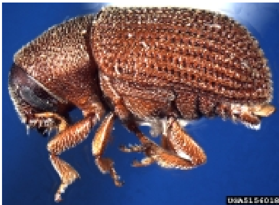
Fig. 1. Native elm bark beetle.

If you remember "Captain Kangaroo," you may also remember the American elm in all its glory. Dutch elm disease killed a huge portion of the population, especially in the eastern United States. A native (Figs. 1 and 2) and smaller European elm bark beetle spread this fungal disease among the trees. Scientists worked hard to develop an American elm that was resistant to the disease. Over recent years, several cultivars have been identified and released. We may never return to a street lined with large elms in every town, but the elm is worth a new look. In a bit of possible irony, it may turn out that elm is a good replacement for the threatened ash.