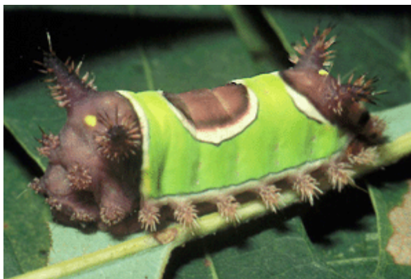
Fig. 3. Saddleback caterpillar.

It is stinging caterpillar season. Some of the stinging caterpillars are called slug caterpillars because their prolegs lack the tiny hooks that most other caterpillars have and the prolegs are so short that some of the slug caterpillars resemble slugs. Several species of slug caterpillars, saddleback caterpillars (Fig. 3), hag moth caterpillars and stinging rose caterpillars have stinging hairs that can inflict a quite painful sensation.