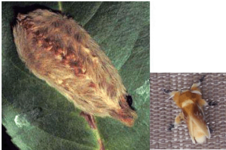
Fig. 4. Puss caterpillar (left) and adult moth (right).