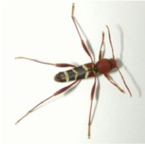
Fig. 3. Redheaded ash borer.