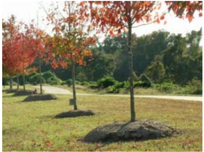
Fig. 4. Over-mulched trees on Centennial Blvd. in Raleigh.