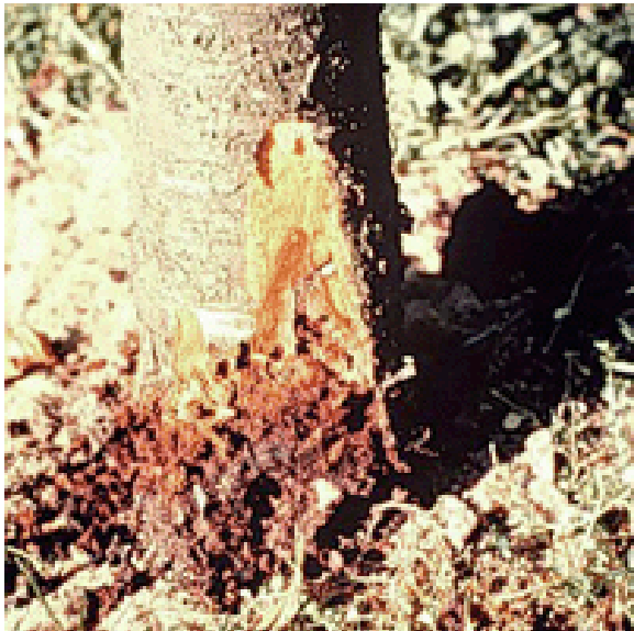
Fig. 1. Frass and tunneling by the peachtree borer.

I'm not sure how everything is surviving the extreme hot temperatures, but peachtree borer season should be building by the end of the month. These insects are common on peach and related Prunus trees, including some laurel varieties. Symptoms are frass and possible gum exudate (Fig. 1) around the base of the tree or shrub. There are several out-of-date treatment suggestions floating around. The most reliable treatment is preventive bark sprays on the lower trunk and crown region. There is no practical treatment for insects already boring in the wood. Though some adult moths (Fig. 2) are present most of the summer, the first of September is the peak moth flight period in eastern North Carolina. For additional information on the peachtree borer, see Ornamental and Turf Insect Note No. 141 on the web at: http://www.ces.ncsu.edu/depts/ent/notes/O&T/trees/note141/note141.html .