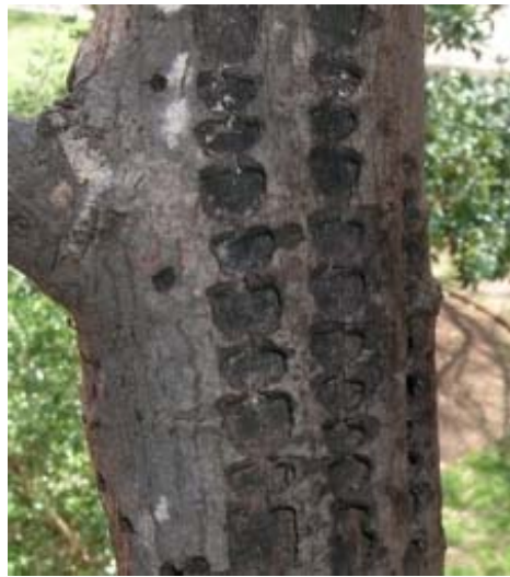
Fig. 4. Yellow-bellied sapsucker damage.