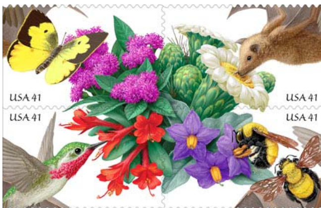
Fig. 1. “Pollination” stamp series.