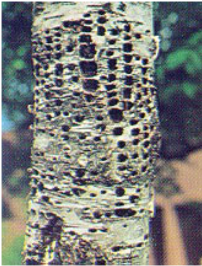
Fig. 3. Yellow-bellied sapsucker damage.