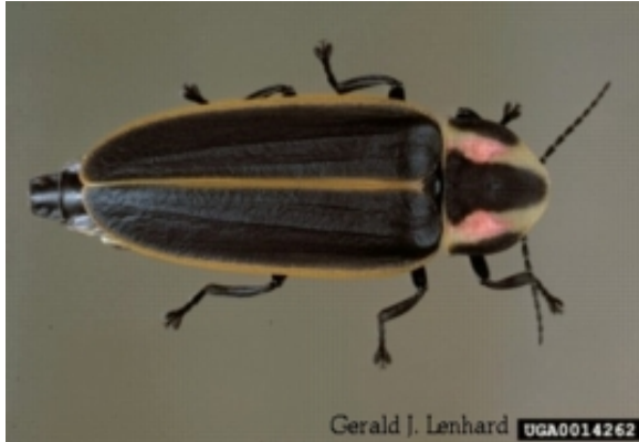
Fig. 8. Firefly adult.

Fireflies (Fig. 8) are not flies and lightningbugs are not bugs. For that matter, they aren't fire or lightning, either. They are, however, active now. Since we talked about slugs last week, it is a good time to mention these helpful beetles that produce light through the miracle of bioluminescence. Firefly larvae (Fig. 9) like to feed on slugs and snails and a few other soft-bodied night creatures. They are said to be able to track snails down by detecting their slime trail. Good habitat and conditions for slugs and snails may produce good habitat for lightningbugs. The best lightningbug areas tend to be near water sources and on the edges of wooded areas with good organic soils.