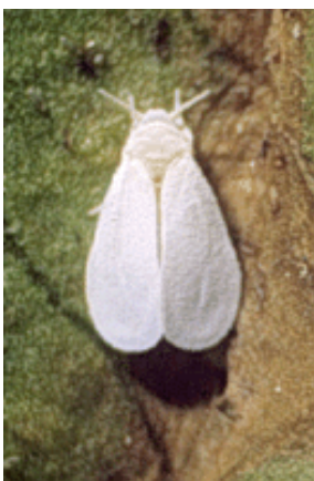
Fig. 5. Citrus whitefly adult.

Perhaps the major pest of gardenia is citrus whitefly (Fig. 5). It is often not recognized if there are no adults flying about and the nymphs more closely resemble scale insects (Fig. 6). The first symptom is usually black sooty mold fungus on the shrub. The citrus whitefly is a tiny white insect about 2 mm in length. It is not a true fly. Females insert their eggs into the lower surface of the leaves of gardenia and Swedish ivy. Soon the immature stages hatch into scale-like insects that suck sap from the lower leaf surface. Look for ant activity, honeydew, or sooty mold on these plants. There is additional information in Publication AG-136, Insect and Related Pests of Flowers and Foliage Plants ( http://ipm.ncsu.edu/AG136/ncstate.html ). Horticultural oils should give good control of the citrus whitefly. Orthene is also effective and imidicloprid is helpful in some situations.