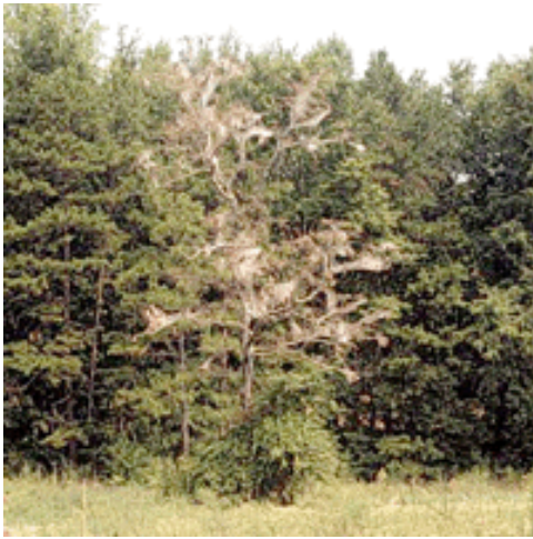
Fig. 10. Persimmon tree with webs from fall webworms.

Recommendations for the use of chemicals are included in this publication as a convenience to the reader. The use of brand names and any mention or listing of commercial products or services in this publication does not imply endorsement by North Carolina State University, North Carolina A&T State University or North Carolina Cooperative Extension nor discrimination against similar products or services not mentioned. Individuals who use chemicals are responsible for ensuring that the intended use complies with current regulations and conforms to the product label. Be sure to obtain current information about usage regulations and examine a current product label before applying any chemical. For assistance, contact an agent of North Carolina Cooperative Extension.