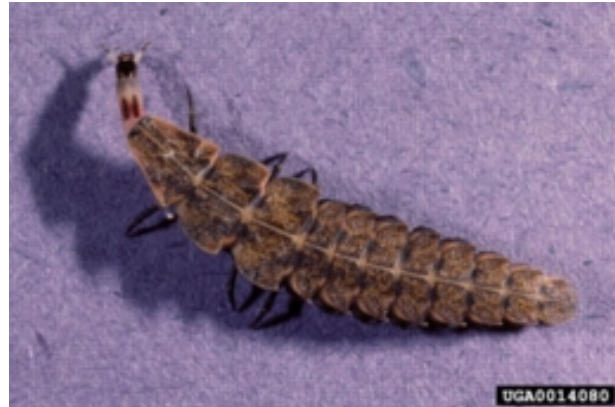
Fig. 9. Firefly larvae.

These critters flash to find a mate, but not like college students at Mardi Gras. Some species will synchronize all their flashes, some flash at different rates and some flash at different periods during the night. There is even a beetle that flashes to trick and attract others in order to eat them. For more information about lightningbugs/fireflies and their habitat, visit the following website: http://iris.biosci.ohio-state.edu/projects/FFiles/frfact.html .