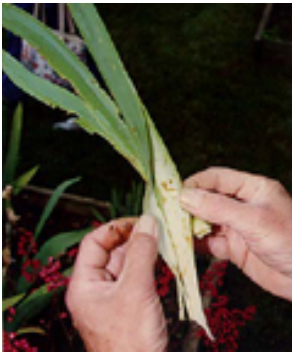
Fig. 7. Iris borer damage.

Iris borer damage (Fig. 7) begins in the foliage and may be evident now. Most of the time, the damage is to rhizomes discovered when people dig them to transplant during the summer. The moths emerge in late summer to mate and lay eggs on the oldest, roughest, dead and bleached iris leaves or on plants nearby. The eggs hatch the following spring. The tiny caterpillars first feed on the new foliage and sometimes cause the margins of the leaves to be ragged. The holes caused by the young caterpillars bleed causing deposits of sap on the leaves. The caterpillars then mine in the leaves for a time before working downward toward the rhizomes. The caterpillars are about half grown by the time they reach the rhizome. There they feed on the edge or on the underside of the rhizome, sometimes boring inside. Often a single caterpillar may completely the insides of a rhizome before moving to another. The mature caterpillars are pale yellow/pink to pink in color with brown heads.