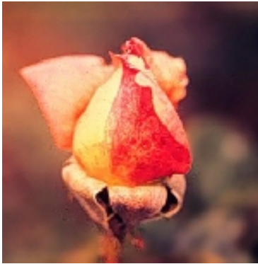
Fig. 2. Thrips damage on rose.

The eastern flower thrips, Frankliniella tritici , feeds mainly on flowers (Fig. 2) and fortunately is not known to vector any virus. Because of their tiny size, flower thrips are carried over large areas by wind systems. Flower thrips are found throughout North Carolina with peak migration early to mid June. They have been found on dozens of hosts. Control of flower thrips is difficult because of constant migration from weeds, grass, flowers and trees. They are also known to make a mild, but noticeable "nip" to the skin.