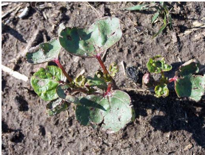
Fig. 1. Cotton seedlings.

As sometimes happens, the general appearance of our cotton crop seems to have actually worsened this past week, perhaps a combination of our cool night time lows, the rough start and heavy thrips pressure. I had thought by this time, cotton would have taken a strong turn for the better. The cotton seedlings in Fig. 1 are probably pretty typical. This cotton looks more like our untreated checks in most years, but is, in fact, seedlings treated with a foliar spray of Orthene at 0.3 pounds of active ingredient per acre behind 5.5 pounds of Temik 15G at planting.