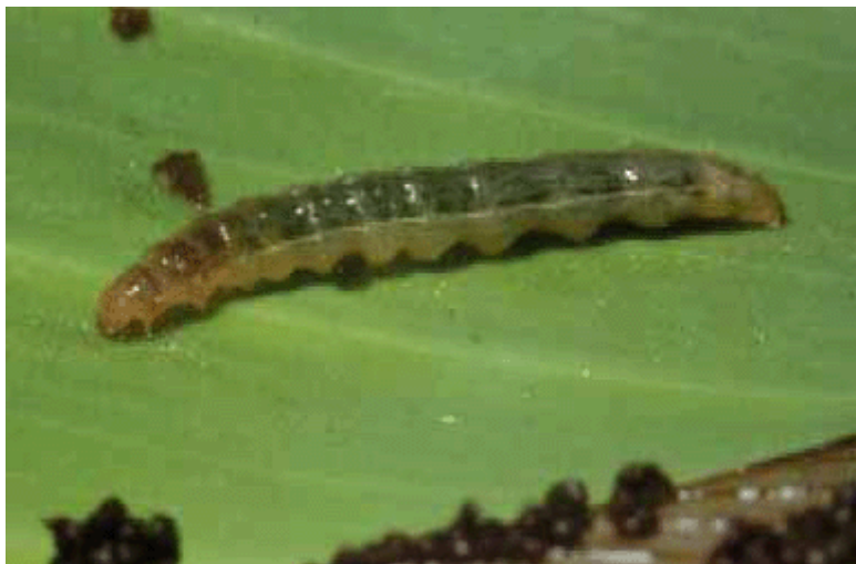
Fig. 2. Lesser canna leafroller exposed by unrolling leaf. The caterpillar grows to about one inch long.

Lesser canna leafrollers are small caterpillars (Fig. 2) related to European corn borers, pickleworms, coneworms and sod webworms. Lesser canna leafrollers overwinter as larvae in the leaves and stems of canna and the moths emerge to mate and lay eggs after the new growth emerges in the spring. When the larvae hatch, they feed within the new, rolled leaves. Older larvae can actually tie the edges (Fig. 3) of older leaves together and roll the leaf! One mistake canna growers make is to leave the old dead growth on the canna bed as mulch. Canna seems to be the only host plant for this pest. If the plants are isolated from other cannas, it may be possible to drastically reduce the lesser canna leafrollers by carefully removing all dead leaves and stems in the fall after the frost has killed it back. It is possible to eliminate this pest by spraying Orthene several times at 10-day intervals. Bacillus thuringiensis ( B.t. ) insecticides are also effective for this pest. Landscapers are encouraged to spray the dilute pesticide mixture directly down into the rolled leaves so that the pesticide can soak into the shelter around the caterpillars. They are especially encouraged to gather and destroy all of the dead tops this winter after frost. For more information on lesser canna leafrollers, visit the following web site: http://ipm.ncsu.edu/AG136/cater12.html .