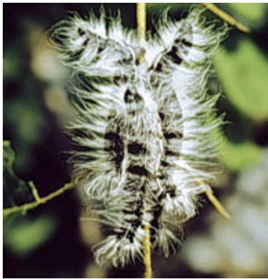
Fig. 5. Full-sized walnut caterpillars in a typical cluster.