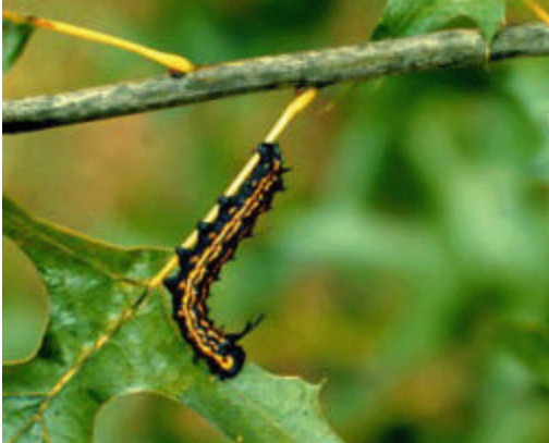
Fig. 4. Portrait of an oakstriped oakworm.

well. The moth is brown in color with a white spot and a dark stripe on each forewing. The moths emerge in June and July and deposit their eggs in clusters of several hundred on the underside of oak leaves. They start as tiny, green caterpillars and eventually grow into attractive black caterpillars with yellow or orange stripes running lengthwise along their bodies. These caterpillars have a prominent pair of spines or slender horns sticking up behind the head. Young caterpillars feed in groups whereas older caterpillars tend to be solitary, although there may be thousands of caterpillars on a single tree. Small trees are sometimes defoliated completely by mid summer.