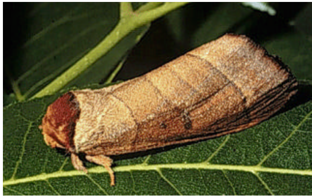
Fig. 6. The walnut caterpillar moth, one of the handmaid moths. Image by James R. Baker.