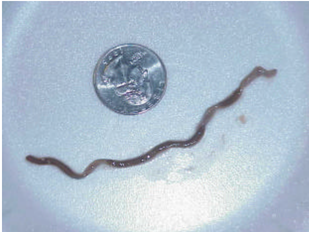
Fig 2. Land planarian, Bipalium kewense .

that wouldn't kill the earthworms, also. Some have heads that slightly resemble that of a hammer head shark, hence sometimes people call them hammer head worms. There is usually a distinct dark, median line down.