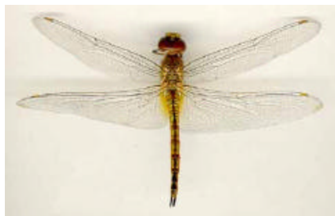
Fig. 1. Wandering glider.

Cars attacked by dragonflies! Well, not quite. The wandering glider ( Pantala flavescens ) (Fig. 1) is one of the most widespread dragonflies. This attractive dragonfly is found from late June to September and often fairly far from water. What makes this species interesting is the habit of the females to dive and dip their ovipositor on the painted surface of certain shiny cars. It may be that the cars appear as pools of water from above. One can observe this in many parking lots at this time of year. Several years ago, we had an auto dealership that felt the dragonflies were damaging or at least marring the polished finish they worked so hard to maintain on their cars.